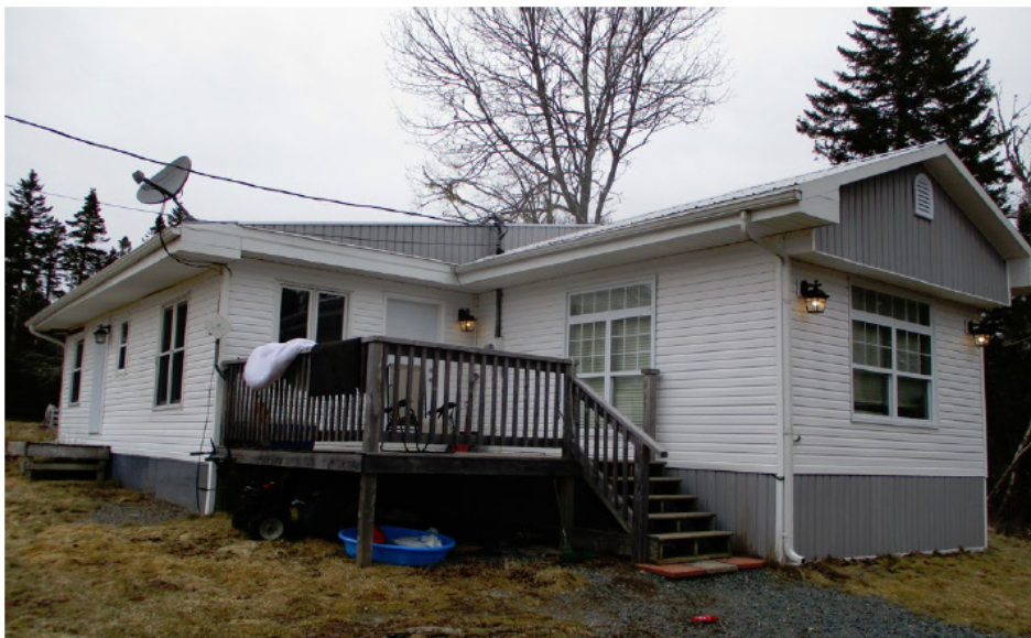
Mini Home w/Addition - Renovated