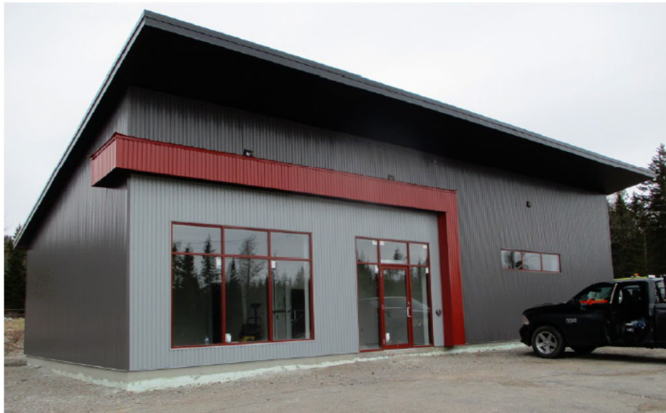
Commercial Building - New