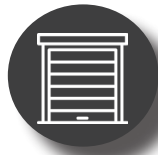
GRADE LEVEL LOADING