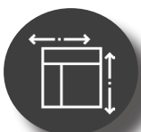
+/- 7.31 ACRES