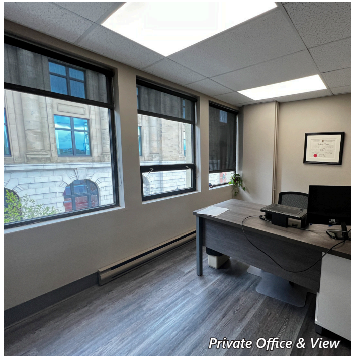
Private Office & View