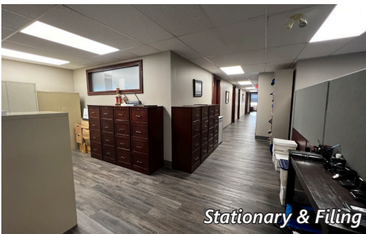
Stationary & Filing